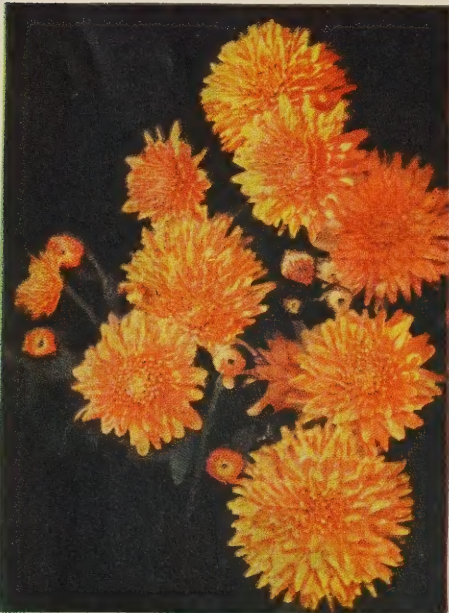
AGLOW. 75c each; 3 for $2.00